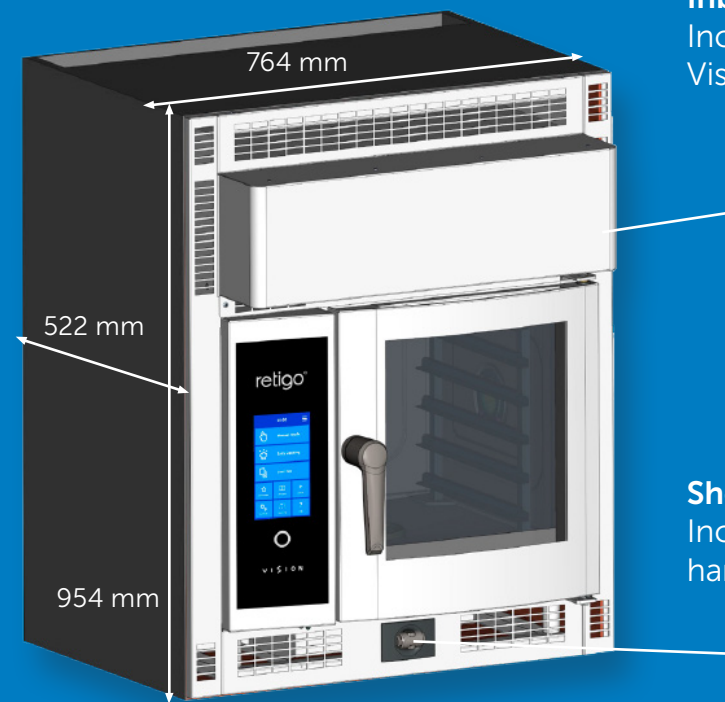
Minimum space to fit inbuilt solution: W: 764 mm / H: 954 mm / D: 522 mm Maximum total weight: 137 kg*